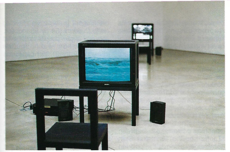
Peter Campus: View of "By Degrees," 1998; at Paula Cooper.

face. The edges are faint, resembling the "ghosts" that come from reprinting a plate.