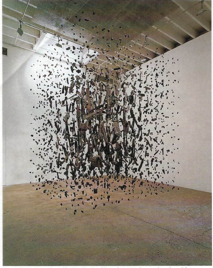
Cornelia Parker: Mass (Colder Darker Matter), 1997, charcoal retrieved from a church struck by lightning, thread, mixed mediums; at Deitch Projects.